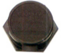
PS-3S Electrode Holder